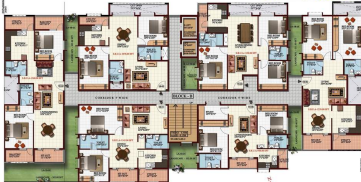
BLOCK-B (FIRST FLOOR)